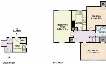
Hayward Close, DA1 4FA

The plan is intended solely as a layout guide, and no liability is assumed for any errors, omissions, or inaccuracies. It does not constitute, in whole or in part, an offer or contract. Any intending purchaser or lessee should satisfy themselves, through inspection, searches, enquiries, and a full survey, as to the accuracy of the information provided. All areas, measurements, shapes, compass bearings and distances are approximate and should not be relied upon for calculation purposes or as the basis of any sale or letting. No guarantee is provided regarding the total area, which may include areas with restricted head height. All measurements are taken at the widest points, internally, unless otherwise stated. May not be to scale. www.servimagis.com